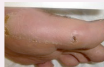
Figures 13-16 (top down) relate to case study 4. Figure 13 shows the wound on 12/09/2009, when treatment with Melladerm Plus commenced. Figure 14 relates to the wound on 17/09/2009, while figure 15 shows the toe on 21/09/2009. Figure 16 shows the healed wound.

Melladerm Plus, while cleansing involved SanoSkin® Cleanser (SanoMed Manufacturing).