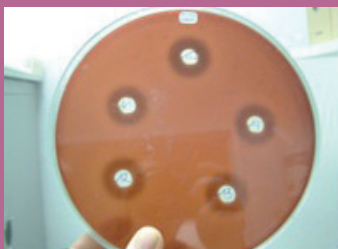
Figure 1 (above) shows dilutions 11% to 15% m/v, while Figure 2 (below) shows dilutions 1% to 5% m/v.

The authors believe that using a gel containing high molecular weight water soluble particles, such as PEG 4000, with a low pH can change the local pH in a wound — resulting in a significantly higher oxygen perfusion in the wound. The pH