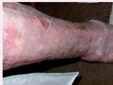
Figures 7-9 (above left to right) relate to case study 2: Figures 5 and 6 both show the wound after seven days of honey gel treatment — most of the crust has dissolved. Figure 7 shows the wound after 15 days of honey gel treatment and compression therapy.